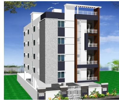
NAVYA NEST (Kondapur)