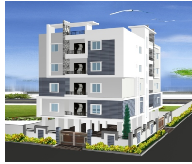
NAVYA CRYSTAL (Kondapur)