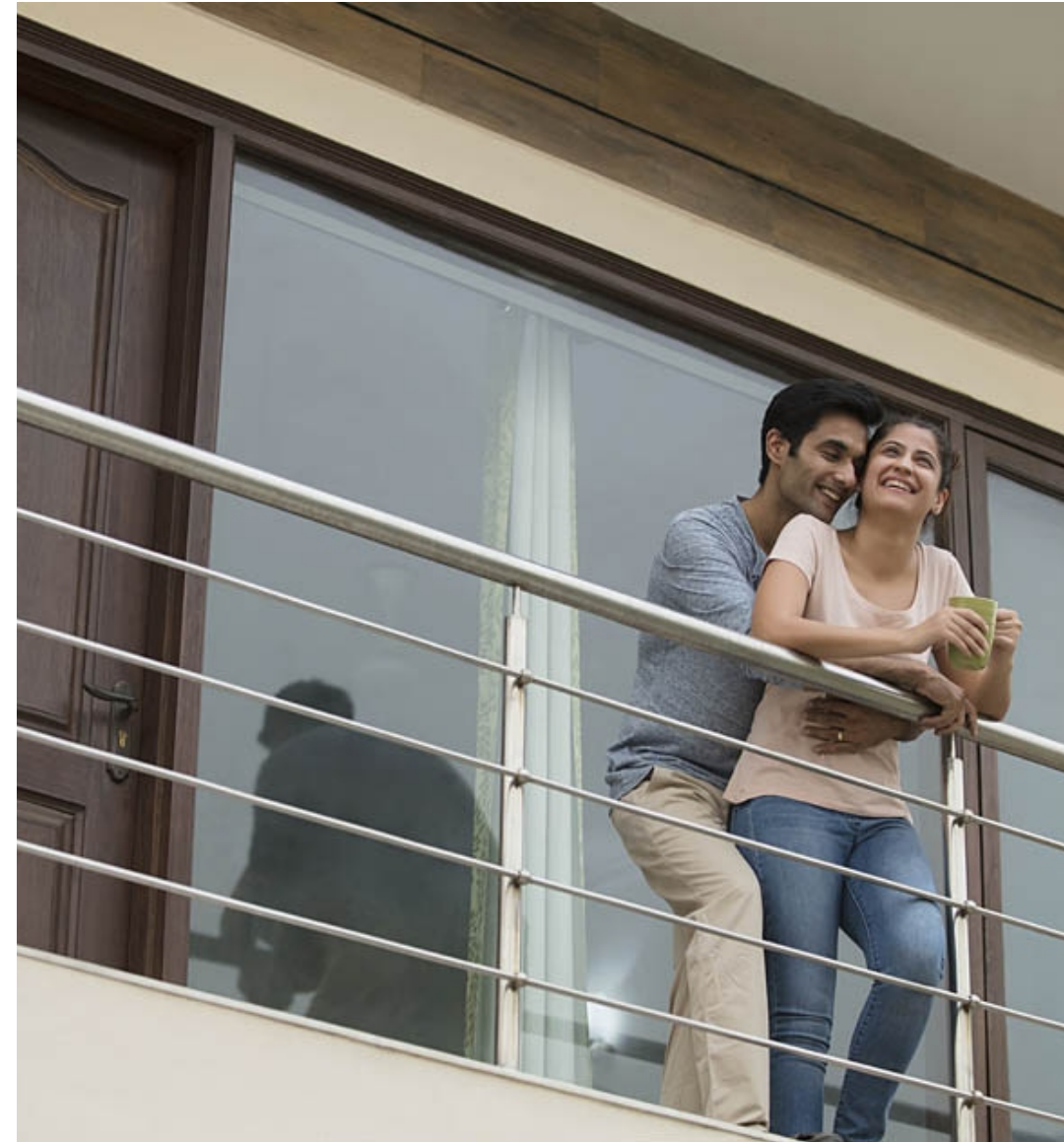
Signature Residential Flats in Hyderabad

Plot. No : 1843, 1844 & 1845 Raja Rajeshwari Nagar , Kondapur,Hyderabad.