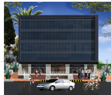
COMMERICAL MALL (L.B. Nagar) NAVYA VAZEER ESTATE

Project consultants : S . S INFRASTRUCTURE PROJECT CONSULTANTS Pvt. Ltd. Begumpet,Hyd.16,Ph.040-27765799.