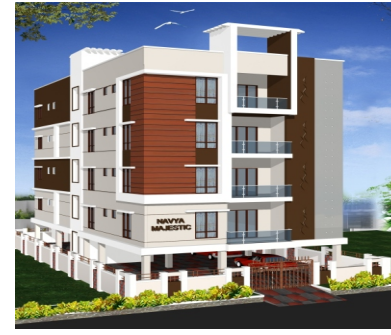
NAVYA MAJESTIC (Kondapur)